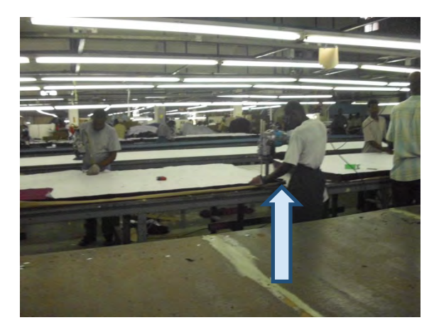
Figure 5. A cutting area in an apparel factory where workers are wearing metal mesh gloves while using blade knife cutters on sheets of fabric. The risk to their hands in the absence of such PPE is clear from the proximity of the hand to the moving blade (arrow).

The common types of PPE utilized in the apparel industry are gloves, eye protection, hearing protection, and respiratory protection. Two quite distinct types of gloves are used: chemical-impervious, such as rubber gloves, for chemical spot cleaning, and metal mesh gloves for cutting tasks which involve the use of a blade knife cutter. Hearing protection may come in the form of either ear plugs or ear muffs. Eye protection (safety glasses or goggles) is used at chemical spot cleaning operations to prevent the inadvertent spraying of solvent into the eyes, and the use of safety glasses by workers is a less preferable alternative to eye guards on sewing machines, since they protect only the eyes and not the entire face.