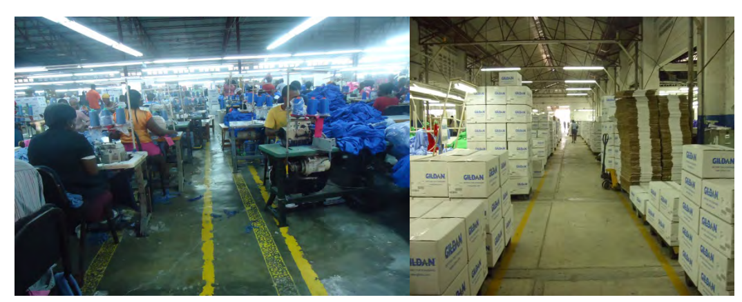
Figure 1. Examples of poor (on the left) and good (on the right) housekeeping and workplace organization, and how these factors may impact means of egress on the factory floor and the ability of workers to evacuate the building. Note on the left how the manufacturing equipment has been allowed to encroach upon the designated egress aisle.

Finally, evacuation plans for all reasonably foreseeable disasters should be developed, since one plan may not fit all. Simply getting the workers to the nearest exit door is not sufficient.