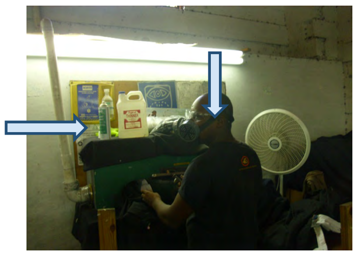
Figure 3. An example of a spot cleaning operation: the respirator is presumably the proper type; that depends upon the specific type of air-purifying cartridges which are provided (vertical arrow). Eye protection is provided, but note that gloves are missing. The ventilation at this work station is questionable: while there appears to be some type of local exhaust ventilation provided via the white pipe (horizontal arrow), the operation of the white fan on the right of the worker would likely disrupt any chance of its effectiveness, and appears to be positioned so that it will blow chemical vapors directly at the worker. Proper chemical selection, location and ventilation could eliminate the need for use of that respirator (imagine wearing it throughout the workday during the summer in Haiti).

For a description of best practices in the global apparel industry associated with Chemical Use for Spot Cleaning, see section C.3 on page 22.