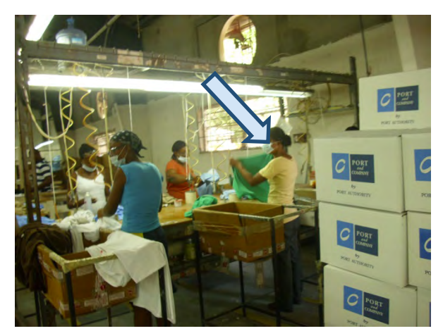
Figure 6. This illustrates the problem which is discussed in the preceding paragraph. The workers at this spot cleaning operation have been provided with loose-fitting dust masks (arrow), which are ineffective against chemical solvent vapors. However, it should also be noted that this location, with windows and overhead exhaust fan, may be preferable for these activities than the location in Figure 3.

The proper type of respiratory protection against solvent vapors, if needed by virtue of inadequate prevention of exposure by other means, is either a half-face or full-face air purifying respirator with cartridges which are approved for organic vapors. The full-face option provides eye and face protection as well as respiratory protection. The use of these respirators is associated with a number of related obligations or requirements for successful protection of the worker, and regular use is uncomfortable and burdensome to the worker. Unfortunately, even if a factory provides the proper type of respirator and cartridges, it virtually always ignores these other issues. These include, in no particular order: